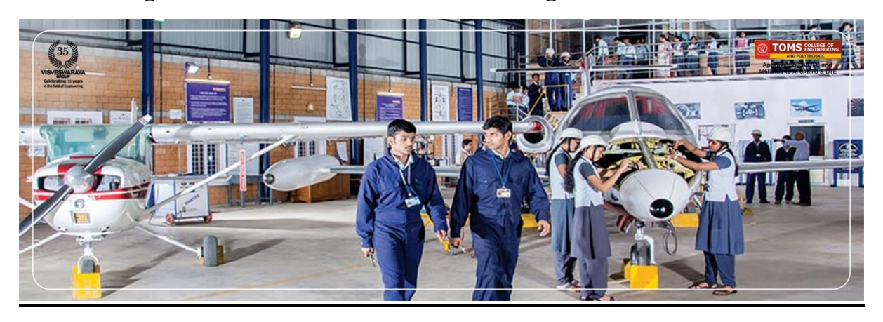
Aircraft engine maintenance for mechanical engineers